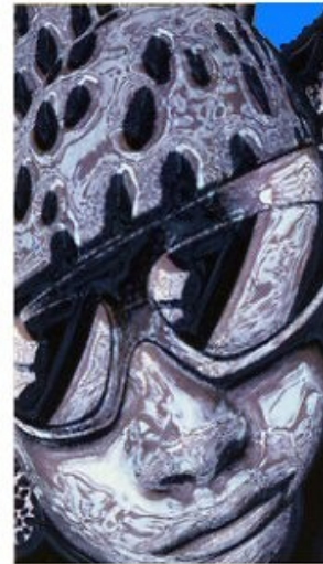
Oppression, Always Oppression

The above images and the name "Lite Metal" are from the game "Modern Art" and are the copyright of Mayfair Games and Hans im Gluck. "Modern Art" is a seriously cool game. Check it and other great strategy games out at www.mayfairgames.com .