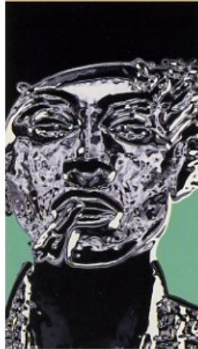
Don't Look at Me, I'm Too Beautiful