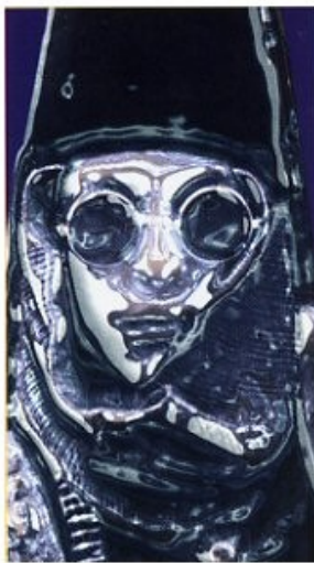
The All Too Well-Known Soldier